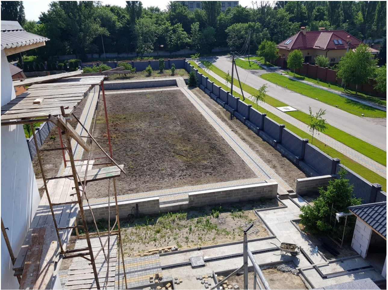
View from the road.